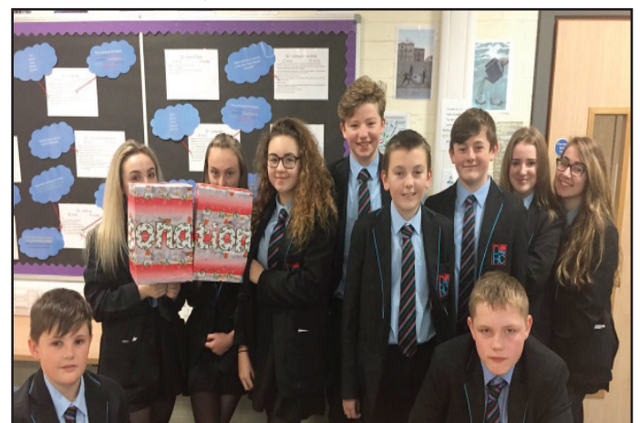
CHARITABLE: Year 9 students at Dyke House ticked a pledge off the list by donating to a food bank

At the end of Year 8, students must have completed three pledges to graduate to Year 9. Also to go to Year 11 prom, seven